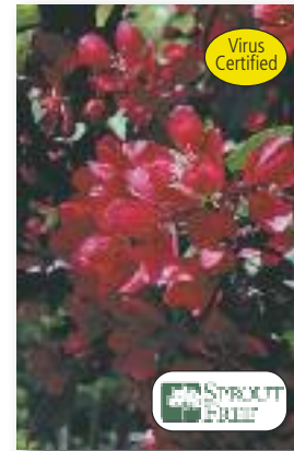
Malus 'Profusion' Profusion Crabapple

This rounded ornamental tree has single deep red flowers in the spring. It yields small red apples in the fall.