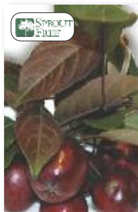
Malus 'Rosina Brooks' Rosina Brooks Crabapple

Dark red spring blooms and colourful, shiny, deep red foliage. Foliage is highly resistant to disease. Small red fruit in the fall.