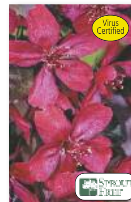
Malus 'Royalty' Royalty Crabapple

Dark red spring blooms and colourful, shiny, deep red foliage make this a good choice for year round colour. Very hardy.