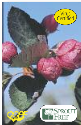
Malus 'Branzam' Brandywine® Crabapple

Hardy columnar tree with a profusion of fragrant white flowers. Yellow red wax-like fruits persisting into the winter. Foliage turns yellow in the fall. It makes a splendid street tree.