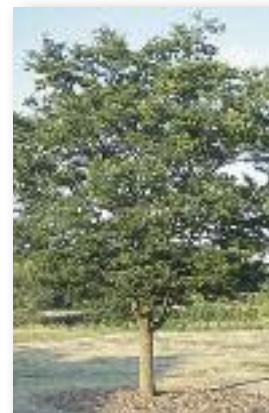
Zelkova serrata 'Green Vase' Green Vase Zelkova

Remarkably dark green and glossy foliage and a sturdy, symmetrical growth habit. Disease tolerant to Dutch Elm disease and Phloem Necrosis.