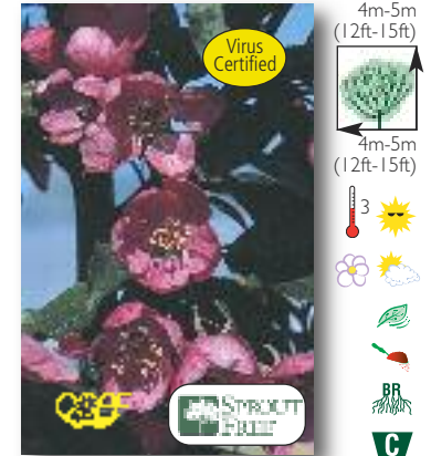
Malus 'Thunderchild' Thunderchild Crabapple

Single pink flowers appear before the purplish-red foliage. Upright spreading growth habit. Hardy and blight resistant.