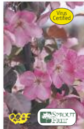
Malus pendula 'Royal Beauty' Royal Beauty Crabapple

Weeping, reddish foliage with very deep pink flowers in the spring. Dark red apples appear in the fall.