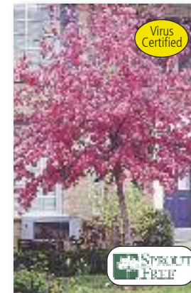
Malus 'Radiant' Radiant Crabapple

Very hardy ornamental tree has deep pink flowers in spring and small, bright red fruit in the fall.