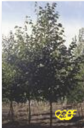
Tilia cordata 'Ronald' Norlin® Linden