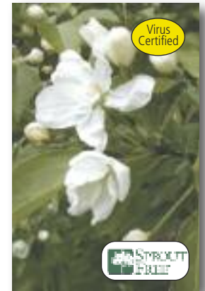
Malus baccata 'Columnaris' Columnar Siberian Crabapple

A vigorous grower that forms a vase-shaped tree with upright, arching branches. Clean, bright green serrated foliage turns orange to red-bronze in the fall.