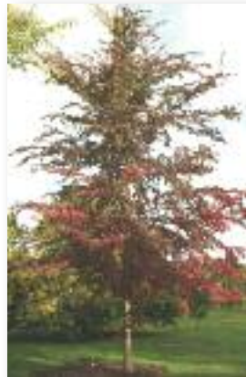
Ulmus 'Frontier' Frontier Elm

A hardy little-leaf Linden hybrid. Selected for rapid growth, resistance to leaf spot, good resistance to leaf gall, and resistance to sunscald.