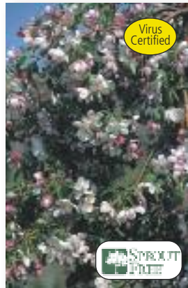
Malus pendula 'Red Jade' Red Jade Crabapple

White blossoms cover this weeping tree in the spring. Foliage is glossy green. Yields an outstanding display of red apples in the fall.