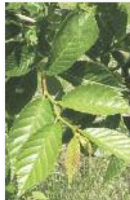
Ulmus 'morton glossy' Triumph™ Elm

The small, glossy, dark green leaves of Frontier Elm turn a rich burgundy colour. The long lasting show of reddish-purple foliage is particularly striking as it appears fairly late in the season.