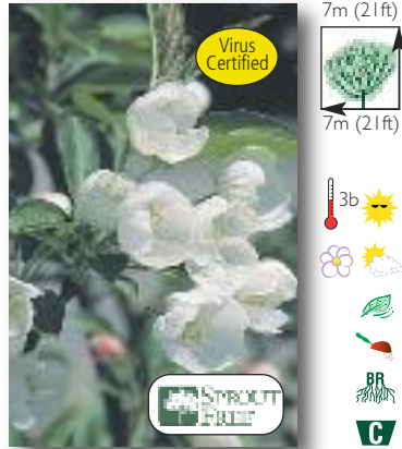
Malus 'Snowdrift' Snowdrift Crabapple

Masses of single white flowers open from red buds. Small red-orange fruit persists into late fall. Foliage is highly resistant to disease.