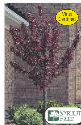
Malus 'Royal Splendor' Royal Splendor Crabapple

Red, glossy foliage with beautiful red flowers in spring, followed by medium sized fruit. Hardy, faster growing variety than 'Royalty'.