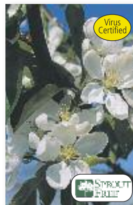
Malus 'Dolgo' Dolgo Crabapple

This vigorous grower has upright columnar growth when young. Rose red blossoms appear in the spring.