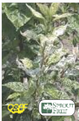
Malus 'Rainbow' Rainbow Crabapple

Numerous white flowers cover the plant in spring. Green foliage becomes marbled with white in late spring, early summer. Small reddish fruits in September. Excellent disease resistance.