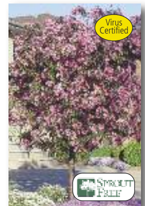
Malus 'Hopa' Hopa Crabapple

Golden yellow fruit covers this ornamental tree well into the winter, adding colour to snowy landscapes.