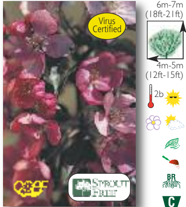
Malus 'Rudolph' Rudolph Crabapple

Clear red flowers in spring with glossy bronze foliage will make this a bright addition to your landscape. Very hardy.