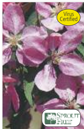
Malus 'Centzam' Centurion® Crabapple

Special features of this standout include fragrant, double pink flowers in spring and large, yellow fruit in the fall.