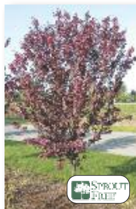
Malus 'Royal Spectacular' Royal Spectacular Crabapple

Spectacular pink-red flowers in spring followed by red, glossy foliage and medium sized fruit. Hardy and more vigorous than 'Royalty'.