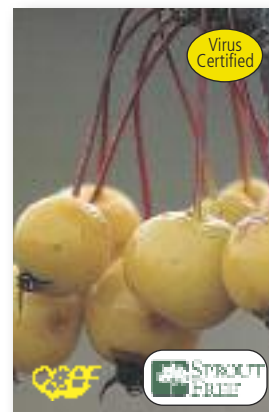
Malus 'Hargozam' Harvest Gold Crabapple

Large white blossoms are beautiful on this early-blooming, very hardy variety. Bright red fruits are excellent for preserving or in jellies.