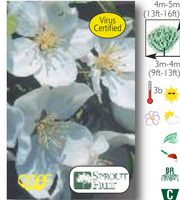
Malus 'Sutyzam' Sugar Tyme® Crabapple

The showy white blooms in spring and bright red fruit in the fall and winter make this ornamental tree a sure standout in any landscape.