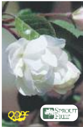
Malus 'Mazam' Madonna® Crabapple

Long lasting double white flowers adorn this compact, upright small tree. An excellent landscape choice.